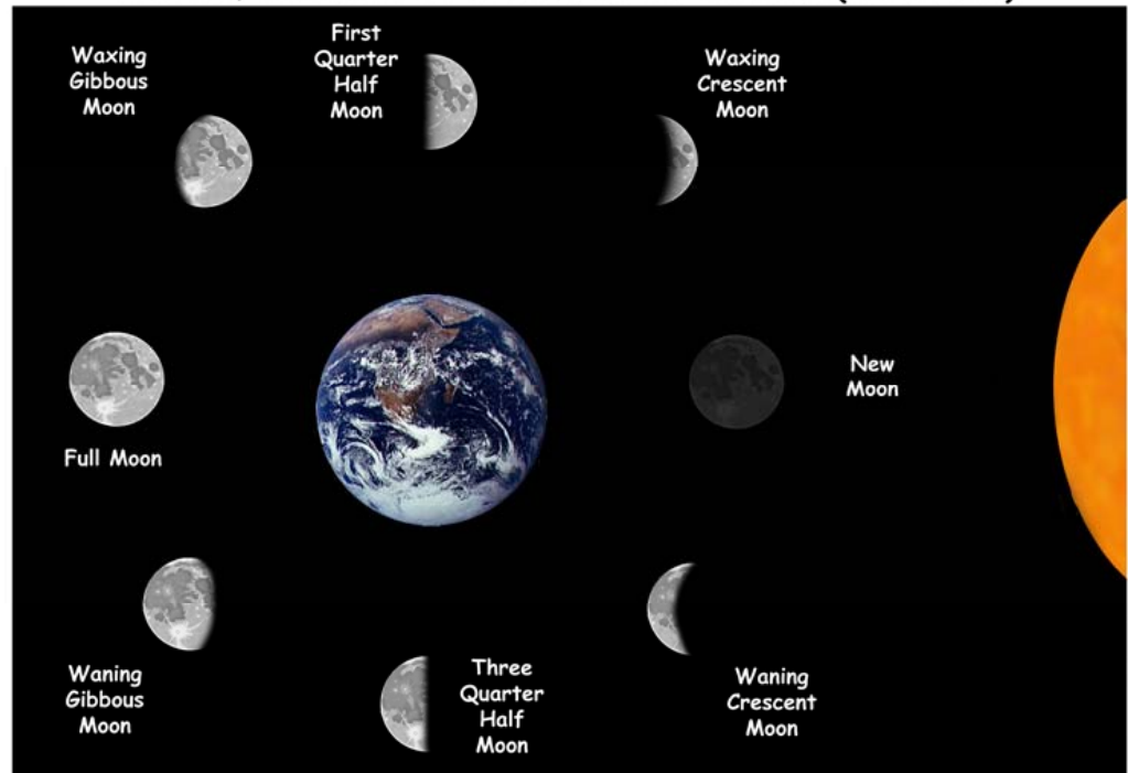
Phases of the Moon as it Revolves Around the Earth (not to scale).